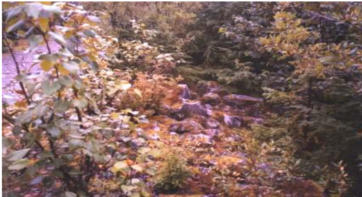
Photo 3: The river-side side slope of the dike near the downstream end of the project. This view shows the armor layer in place (at least the upper end of the layer). The dike top width here is 4-6 feet wider than most of the eroded upstream section of the project where the crest extends over the top face of the bedding and armor layers.