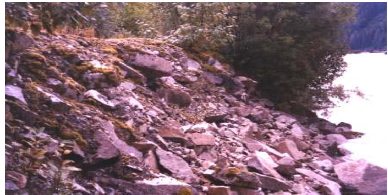
Photo 2: The dike side slope at the upstream end of the project. From the size of the material, it appears that the armor layer is totally gone. The side slope is approximately 1:1 rather than the constructed 2:1.