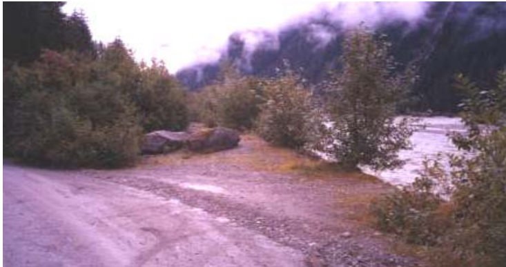
Photo 1: The dike crest at the upper end of the project, looking downstream.